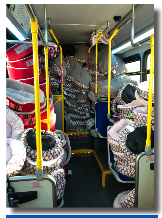
The BARTA Bus stuffed with Pet Beds.

Free Pet Bed Distribution - Humane Pennsylvania How does Humane Pennsylvania in Reading, PA distribute over 5,000 free pet beds to Berks County residents? They call BARTA and stuff a bus full of pet beds and travel to different locations on the Santa Free Pet Bed Express. Humane Pennsylvania, the management organization that oversees The Humane Society of Berks County, contacted BARTA for help in distributing the 5,000 donated pet beds they received from PetSmart. On Thursday, December 19, 2019, Humane Pennsylvania staff and BARTA staff traveled in a bus full of 700 Pet Beds to seven different locations. 100 Pet Beds were distributed at each location throughout the day. Other events were held by Humane Pennsylvania to distribute all the beds to the community during the holiday season.