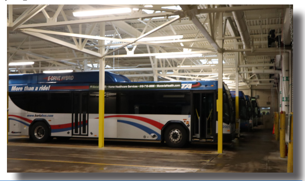
All BARTA vehicles can fit inside expanded facility helping with cleanliness of the vehicles.